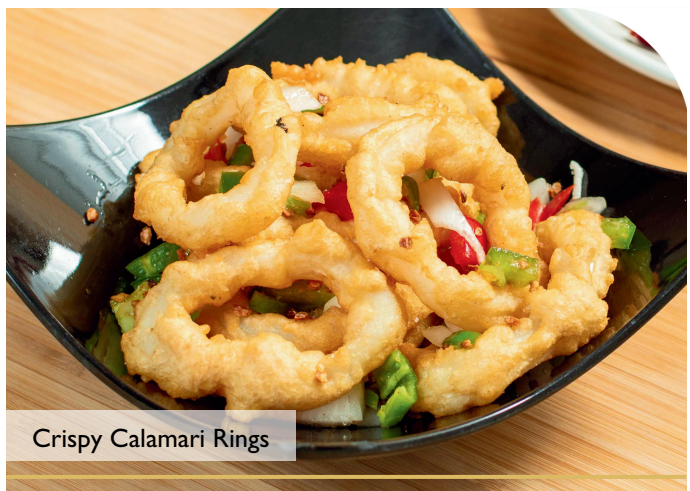
Crispy Calamari Rings