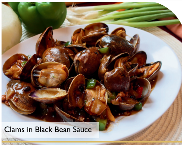
Clams in Black Bean Sauce

Stuffed Long Hot Peppers (shrimp) 16 釀虎皮椒