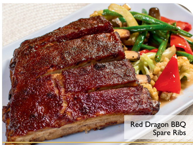
Red Dragon BBQ Spare Ribs