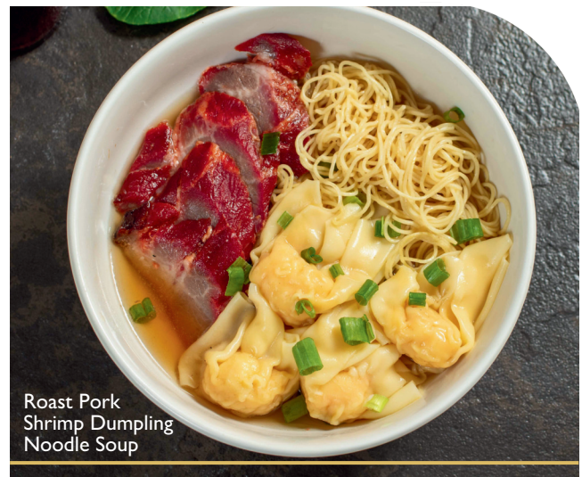
Roast Pork Shrimp Dumpling Noodle Soup