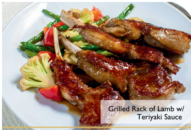
Grilled Rack of Lamb w/ Teriyaki Sauce

Sichuan Style Beef with Hot Green Peppers 18 麻辣青椒牛