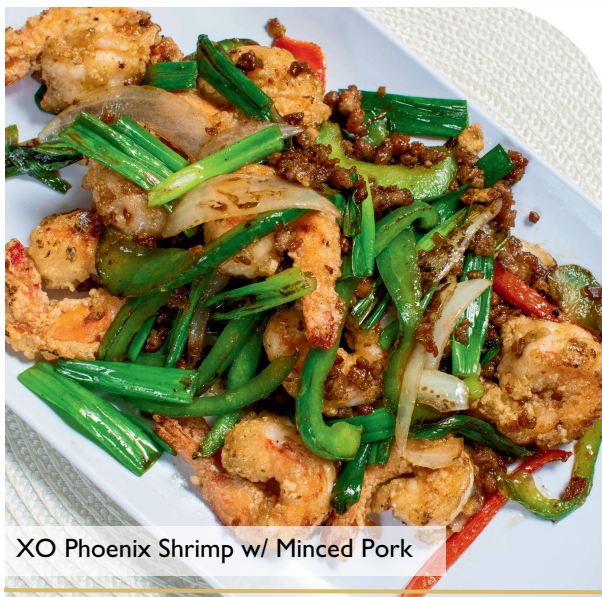
XO Phoenix Shrimp w/ Minced Pork