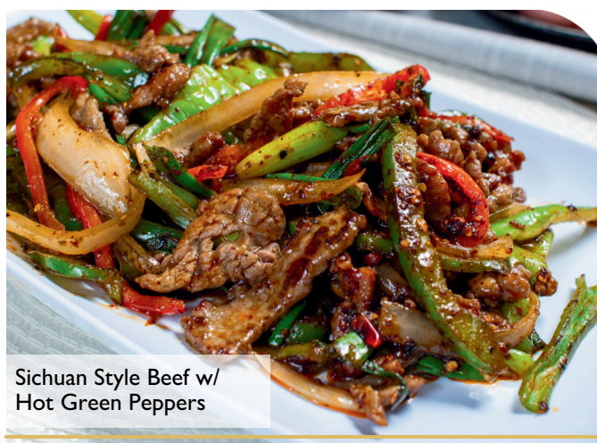
Sichuan Style Beef w/ Hot Green Peppers