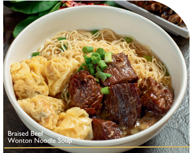
Braised Beef Wonton Noodle Soup

** all noodle soups include scallions and green vegetables