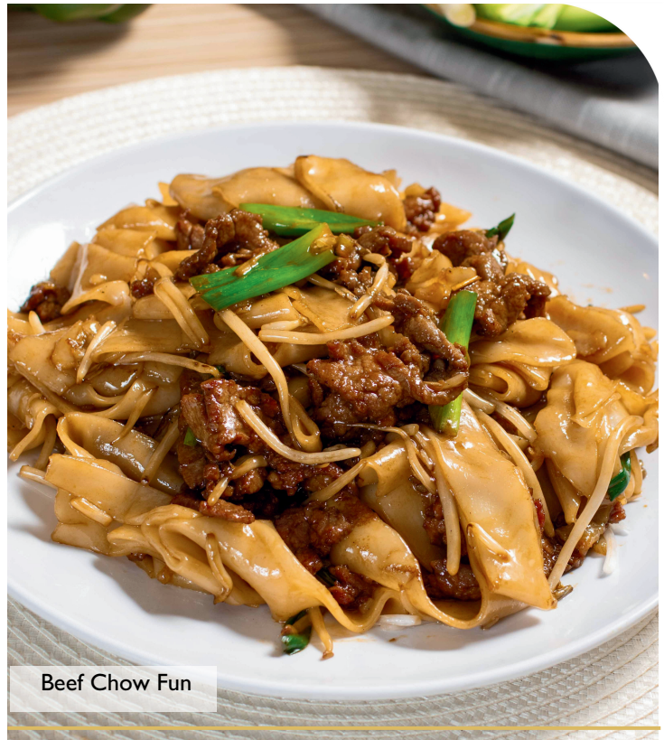
Beef Chow Fun