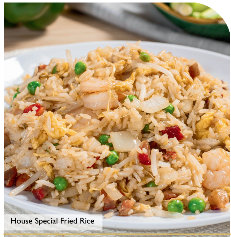
House Special Fried Rice