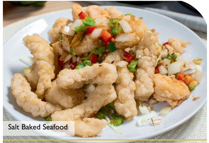
Salt Baked Seafood

Maine Lobster with Ginger Scallion MP Sauce 姜葱炒龍蝦