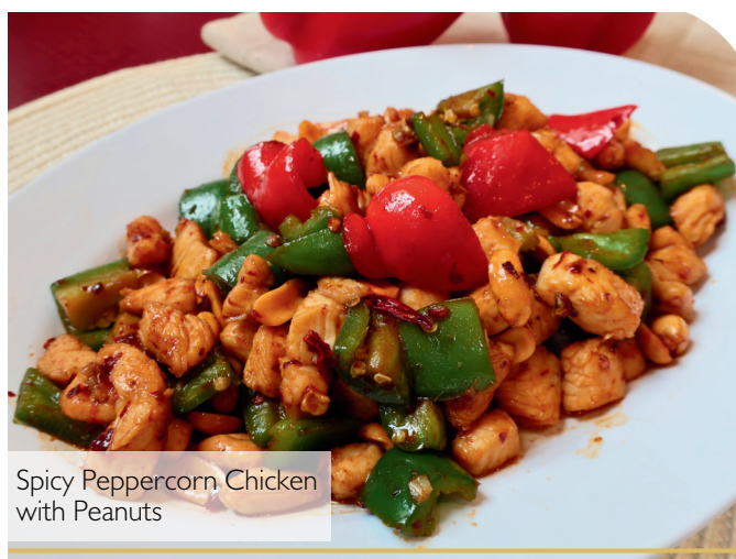
Spicy Peppercorn Chicken with Peanuts

Peking Spare Ribs (Pork Tenderloin) 17 京都骨