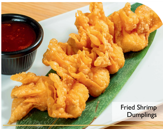
Fried Shrimp Dumplings

Steamed or Pan Seared Edamame Dumplings 12 素菜餃子 (蒸 / 煎)