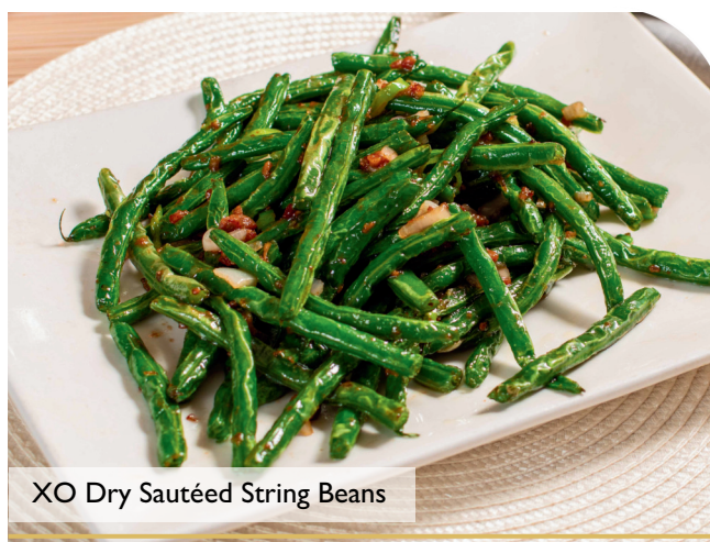
XO Dry Sautéed String Beans

Sautéed Chinese Broccoli (Gai Lan or Yu Choy) 清炒芥兰