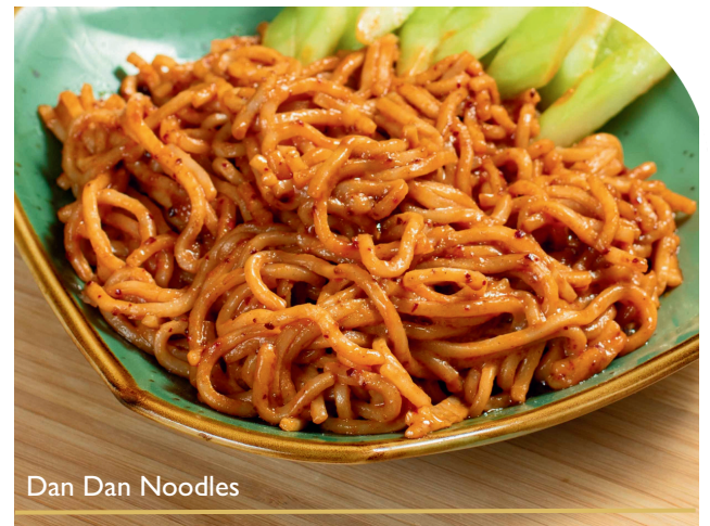
Dan Dan Noodles