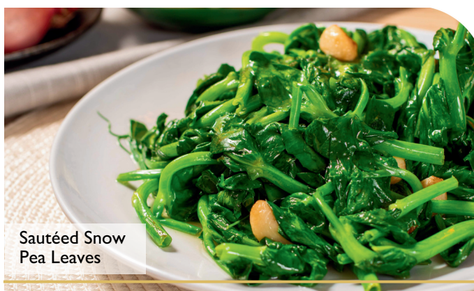
Sautéed Snow Pea Leaves