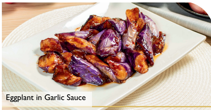
Eggplant in Garlic Sauce