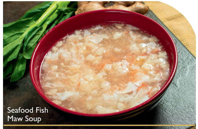
Seafood Fish Maw Soup