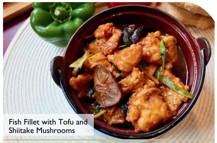
Fish Fillet with Tofu and Shiitake Mushrooms